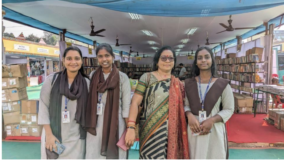
Visit to the Annual State Book Fair in Bhubaneswar