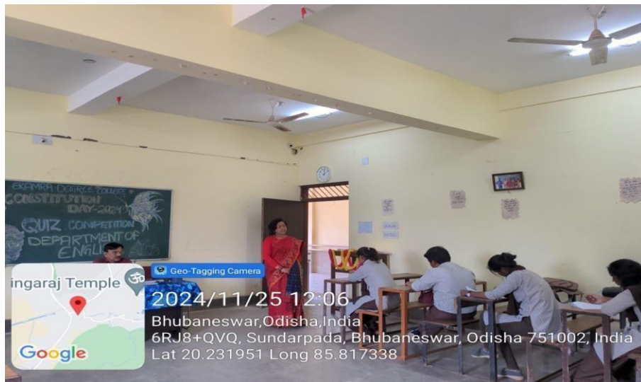
Quiz Competition on Constitution Day

Quiz and Essay competitions were organized by the department on the special occasion of "Constitution Day". Students of the department participated in the Competition enthusiastically.