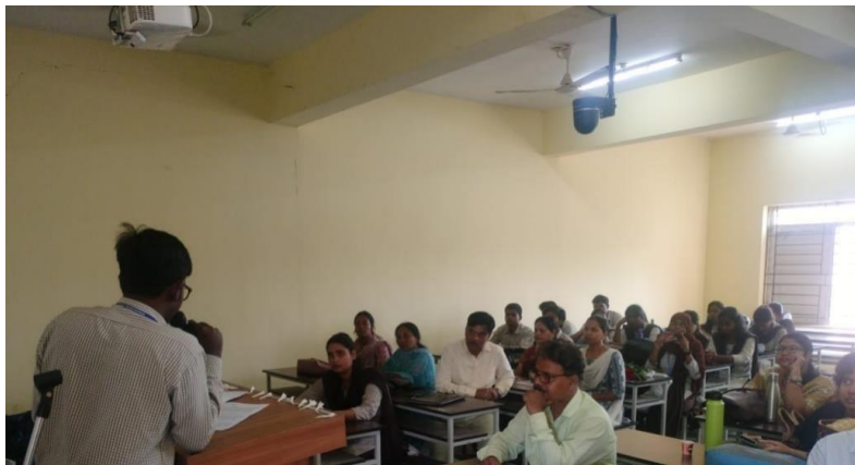
Seminar on "Post Colonial Perspectives in Modern Literature"

+3 final year students presented topic. The resource person's speech was highly appreciated by the students.