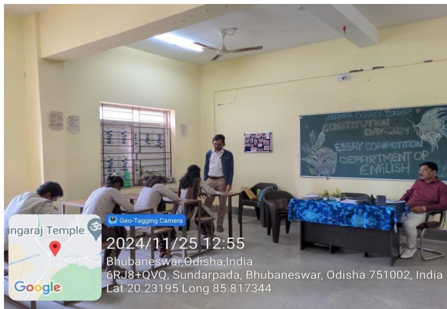
Essay Competition on Constitution Day

3. 26.11.2024-Song and Rangoli Competition