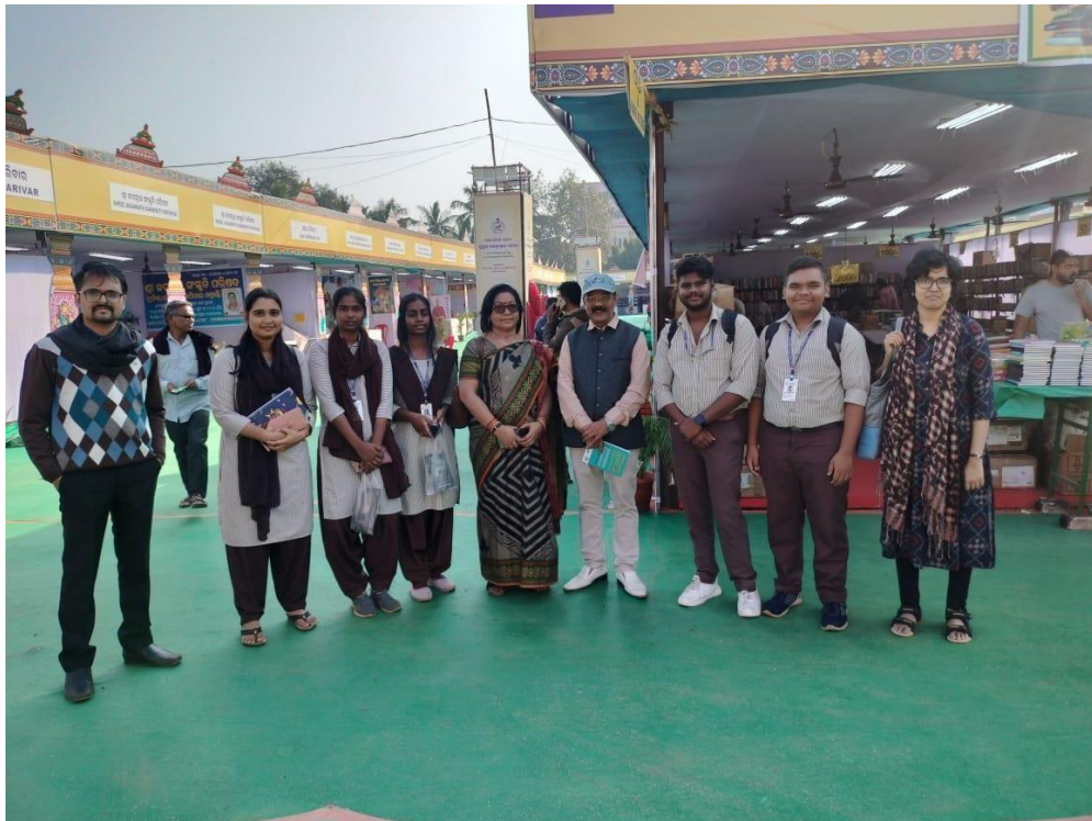
Visit to the Annual State Book Fair in Bhubaneswar